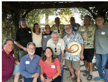
The Living Room Women's Shelter was given a property make-over to provide a shade and quiet space for the families.