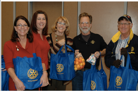
Rotary contributes to the Brookhill food project for 50 families a week.

The evening will include appetizers, beverages and the beginning of many new friendships and new Humanitarian Rotarian members.