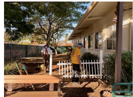
Creating a class room this past year at the Multicultural Center

We look forward to seeing you at the Epicenter on 2-5-20 at 5:30p